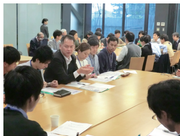
Group discussion during an open forum.

The ICREA holds open forums to address important topics relating to international education, international joint research, and international cooperation in the field of agricultural sciences. Subject matter experts, including researchers and professionals, are invited from both within and outside the country to deliver lectures in these forums. Held periodically as relevant topics arise, these forums are open not only to people from academic institutions but also to the general public. Additionally, several times each year, seminars are held that are open to researchers, students, and the general public, where experts in agricultural research and international cooperation share insights to support the development of developing nations. The ICREA also disseminates quarterly email newsletters to its subscribers, reporting on its current research activities.