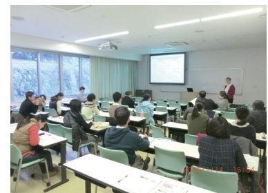
Speakers from various countries are invited to deliver lectures during an open seminar.