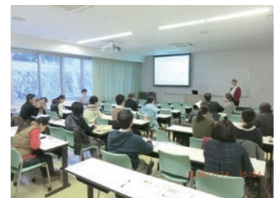
Speakers from various countries are invited to deliver lectures during an open seminar.