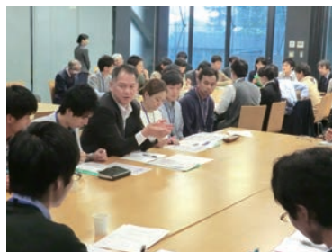
Group discussion during an open forum.

The ICREA holds open forums to address important topics relating to international education, international joint research, and international cooperation in the field of agricultural sciences. Subject matter experts, including researchers and professionals, are invited from both within and outside the country to deliver lectures in these forums. Held periodically as relevant topics arise, these forums are open not only to people from academic institutions but also to the general public. Additionally, several times each year, seminars are held that are open to researchers, students, and the general public, where experts in agricultural research and international cooperation share insights to support the development of developing nations. The ICREA also disseminates quarterly email newsletters to its subscribers, reporting on its current research activities.