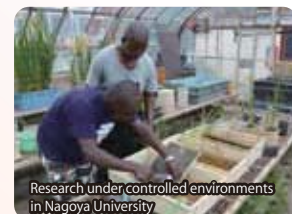
Research under controlled environments in Nagoya University