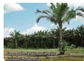
Sago palm field in Southeast Sulawesi, Indonesia