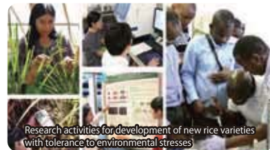
Research activities for development of new rice varieties (with tolerance to environmental stresses)