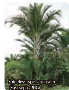
Spineless type sago palm (East sepic, PNG)

In our laboratory, we are investigating the mechanism through which sago palms adapt to saline and acidic soils. Furthermore, we are carrying out field surveys to monitor the growth of sago palms to inform our efforts to develop an effective cultivation management strategy that enables stable growth of sago palms. We are also undertaking the following activities as part of a joint international research project: use remote sensing to estimate the area of the land on which sago palms are growing and to identify areas suitable for growing sago palms, develop technology to make sweeteners from the residue from sago starch extraction, and estimate the socioeconomic impact of the new technology.