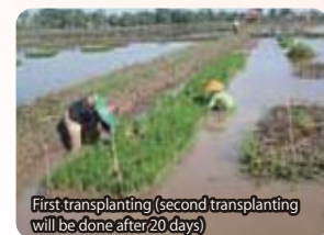
First transplanting (second transplanting will be done after 20 days)