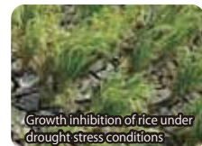
Growth inhibition of rice under drought stress conditions

In addition to the conventional cross breeding and mutation breeding technologies, novel breeding techniques, such as quantitative trait locus (QTL) analysis (which identifies QTLs associated with stress tolerance) and marker-assisted selection (MAS) (which can quickly and accurately identify the presence of a specific quantitative trait locus) are now available to breed improved rice varieties with a greater efficiency, thanks to the recent research advancements in the field of agricultural sciences. Novel techniques, such as next generation sequencing (NGS) (which quickly and inexpensively provides genome-wide genetic information on living organisms) and new plant breeding techniques (NBT) (new approach to genome editing) have also been developed. We are using these technologies to achieve genetic improvement of rice with the goal of securing stable rice production in unfavorable environments.