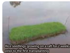
Rice seedlings growing on a raft for 2 weeks prior to the first transplanting