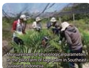
Measurement of physiological parameters at the pilot farm of sago palm in Southeast Sulawesi, Indonesia