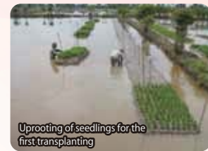
Uprooting of seedlings for the first transplanting

In addition to reevaluating the double-transplanting technique that has been used in the low-lying swamps along the east coast of Sumatra and the west coast of Peninsular Malaysia, we have been investigating the growth response of the locally grown rice varieties to floods to identify the traits associated with flood adaptation of rice varieties that are grown in several different regions with varying water depth levels and varying periods of deepwater flood phase. Our goal here is to ensure stable production of rice crops in flood-prone regions through the use of traditional techniques, and to improve cultivation technology by using fertility management strategies that not only help mitigate the harmful effects of submergence stress but also facilitate recovery from flood damage.