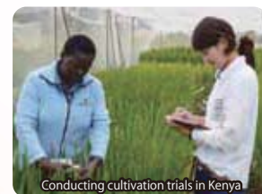
Conducting cultivation trials in Kenya