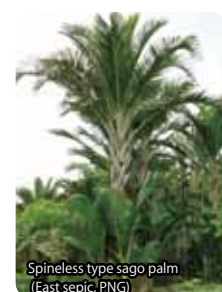
Spineless type sago palm (East sepic, PNG)

In our laboratory, we are investigating the mechanism through which sago palms adapt to saline and acidic soils. Furthermore, we are carrying out field surveys to monitor the growth of sago palms to inform our efforts to develop an effective cultivation management strategy that enables stable growth of sago palms. We are also undertaking the following activities as part of a joint international research project: use remote sensing to estimate the area of the land on which sago palms are growing and to identify areas suitable for growing sago palms, develop technology to make sweeteners from the residue from sago starch extraction, and estimate the socioeconomic impact of the new technology.