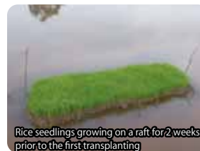
Rice seedlings growing on a raft for 2 weeks prior to the first transplanting