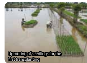
Uprooting of seedlings for the first transplanting

In addition to reevaluating the double-transplanting technique that has been used in the low-lying swamps along the east coast of Sumatra and the west coast of Peninsular Malaysia, we have been investigating the growth response of the locally grown rice varieties to floods to identify the traits associated with flood adaptation of rice varieties that are grown in several different regions with varying water depth levels and varying periods of deepwater flood phase. Our goal here is to ensure stable production of rice crops in flood-prone regions through the use of traditional techniques, and to improve cultivation technology by using fertility management strategies that not only help mitigate the harmful effects of submergence stress but also facilitate recovery from flood damage.