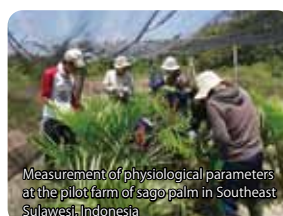
Measurement of physiological parameters at the pilot farm of sago palm in Southeast Sulawesi, Indonesia