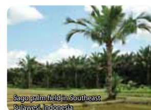
Sago palm field in Southeast Sulawesi, Indonesia