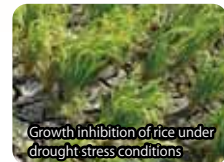
Growth inhibition of rice under drought stress conditions

In addition to the conventional cross breeding and mutation breeding technologies, novel breeding techniques, such as quantitative trait locus (QTL) analysis (which identifies QTLs associated with stress tolerance) and marker-assisted selection (MAS) (which can quickly and accurately identify the presence of a specific quantitative trait locus) are now available to breed improved rice varieties with a greater efficiency, thanks to the recent research advancements in the field of agricultural sciences. Novel techniques, such as next generation sequencing (NGS) (which quickly and inexpensively provides genome-wide genetic information on living organisms) and new plant breeding techniques (NBT) (new approach to genome editing) have also been developed. We are using these technologies to achieve genetic improvement of rice with the goal of securing stable rice production in unfavorable environments.