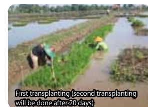
First transplanting (second transplanting will be done after 20 days)