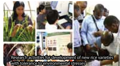
Research activities for development of new rice varieties with tolerance to environmental stresses