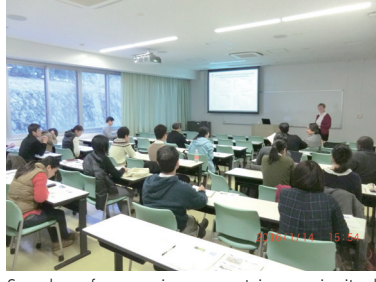
Speakers from various countries are invited to deliver lectures during an open seminar.

where experts in agricultural research and international cooperation share insights to support the development of developing nations. The ICREA also disseminates quarterly email newsletters to its subscribers, reporting on its current research activities.